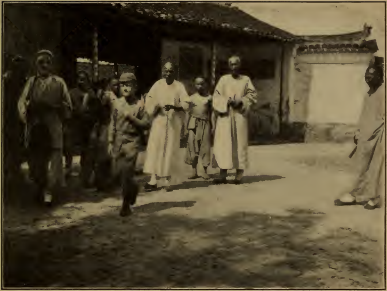
ENTRANCE TO A YAMEN.